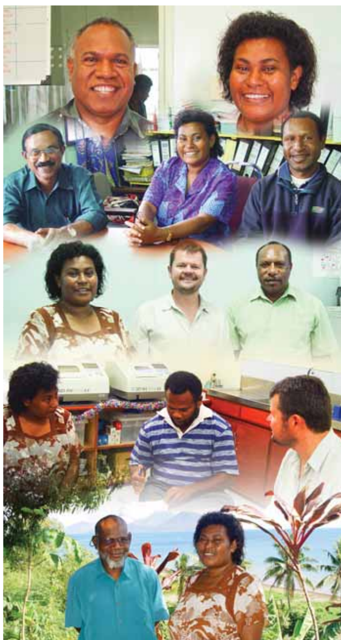
Figure 1: Discussions between representatives of hospital management and ophthalmologists, PNG Eye Care and ICEE