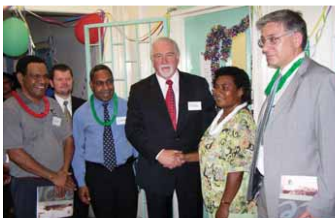
Figure 2: Successful launch of Port Moresby Vision Centre in October 2008